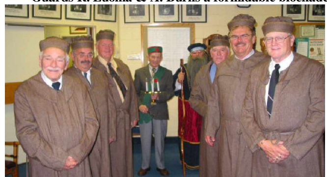
The Council assembles for a matter of utmost importance.